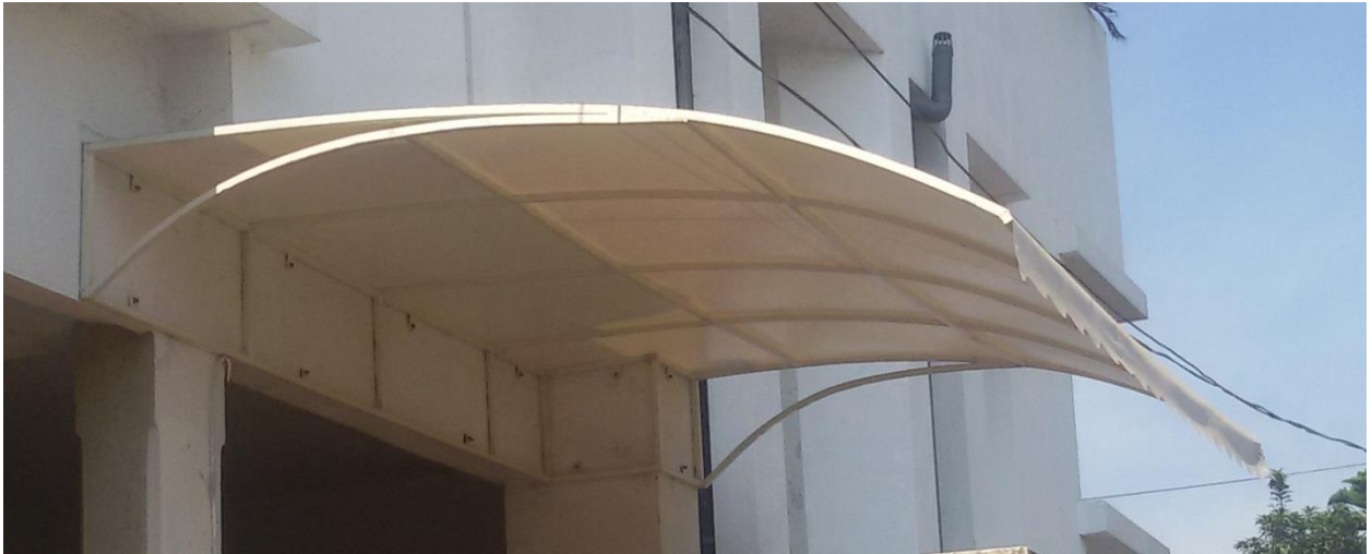
Figure - This Photo is just for understanding